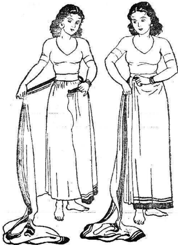
After you have put on the blouse and the slip, By your left hand at first tuck in the plain horizontal end of the sarce, in the slip and turn it around your waist line using your hands per your convenience